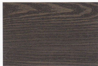
GLH505 Volcanic earth

This sample was produced by 40% dilution with water.