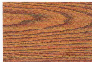
GLH502 Sienese earth