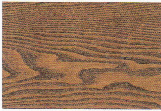
GL400 - GLW400 Cherry