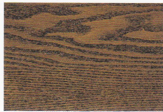
GL401 - GLW401 Blond walnut