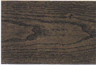
GL404 - GLW404 Walnut