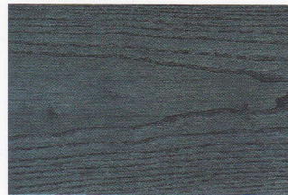
GL406 - GLW406 Blue