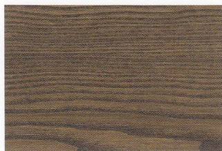
GLH504 Cembra earth