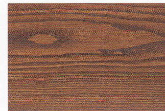
GLH503 African earth