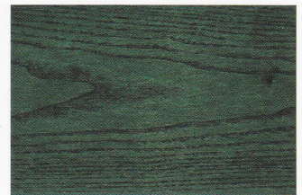
GL407 - GLW407 Green