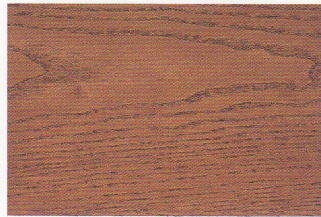
GL405 - GLW405 Mahogany