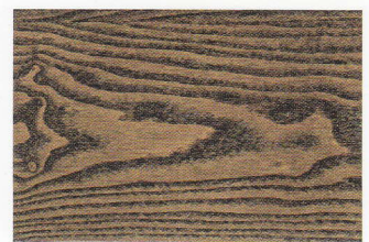
GL403 - GLW403 Antique walnut