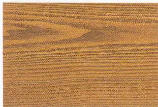
GLH500 Cypriot earth