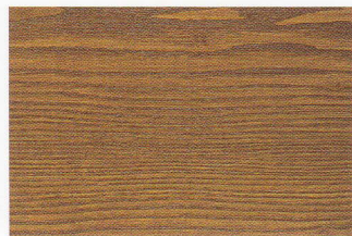
GLH501 Shadow earth