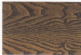
GL402 - GLW402 Chestnut