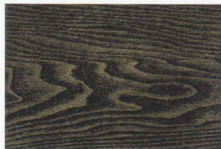
GL409 - GLW409 Ebony

This sample was produced with a dilution ratio of 2:1 (GL:DILUTING AGENT) (GLW:WATER).